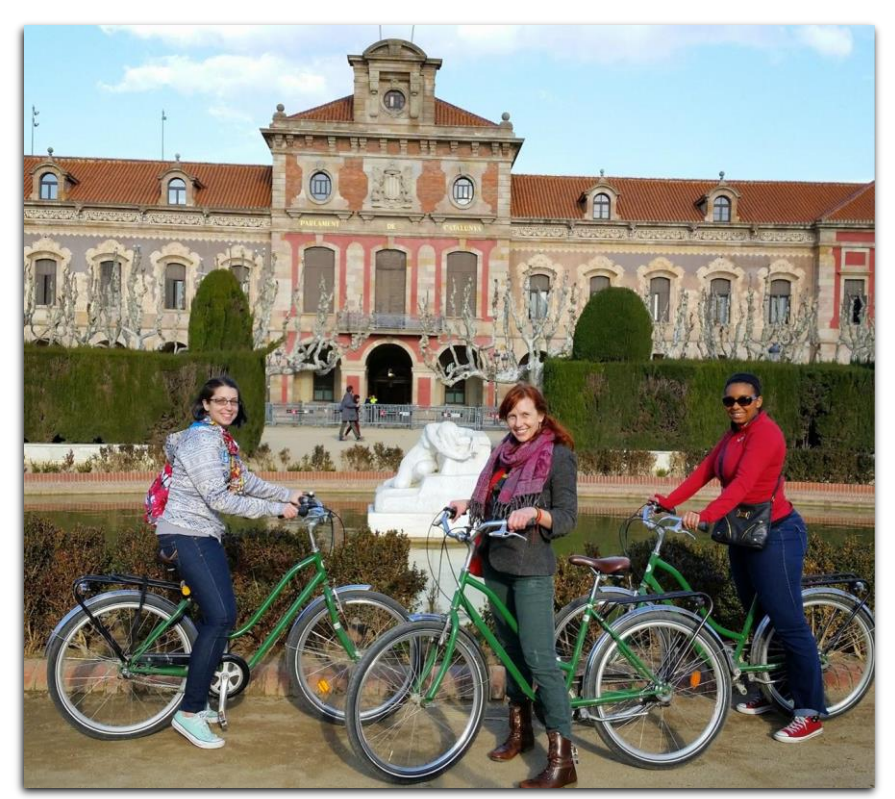
Before the Crash (Barcelona, 2015)