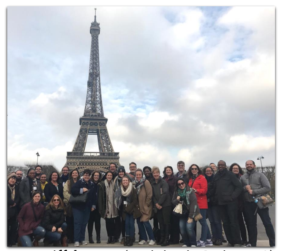
Eiffel Tower (Training in Paris, 2018)