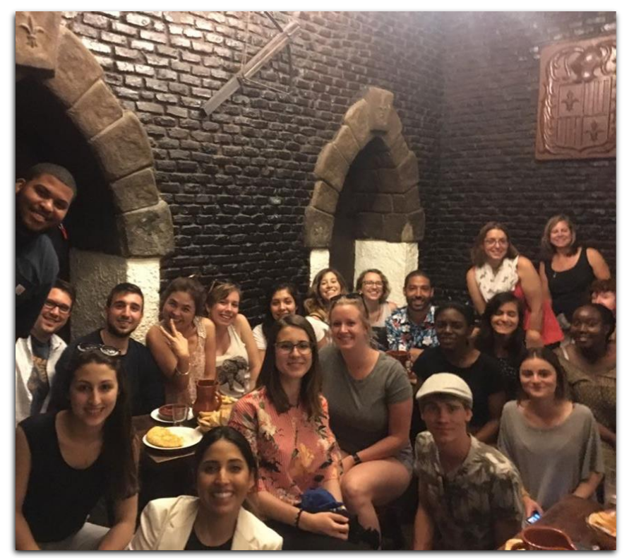
Intercultural Exchange (CTC SPAM, 2017)