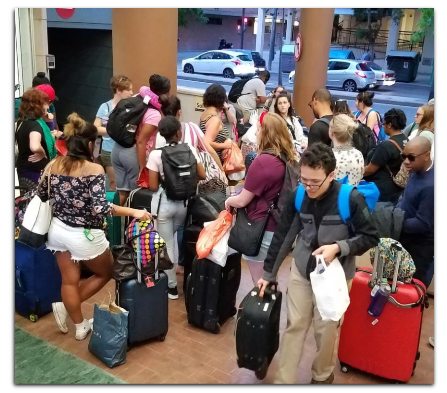
Checking-In in Valencia (CTC SPAM, 2017)