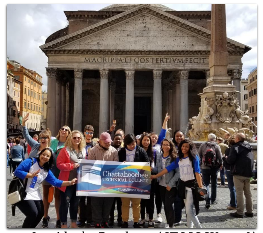
Outside the Pantheon

We are academically focused on providing cultural and historical essential learning experiences, developing international perspectives , and building a well-educated, globally competitive workforce.